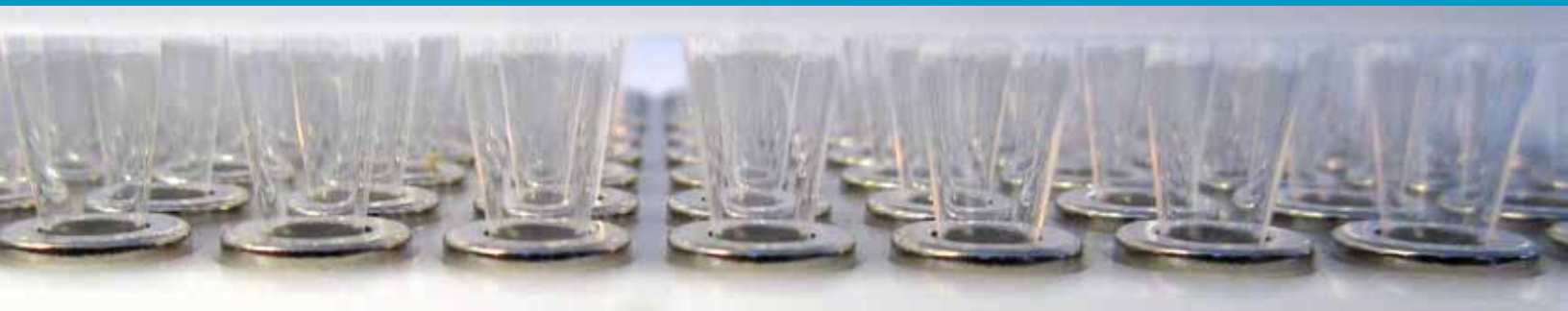
Plate Features and Benefits